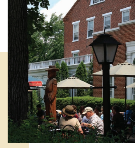
Lancaster County, PA (Lancaster County Planning Commission)

Pennsylvania launched a statewide heritage tourism initiative by working with four pilot regions (Philadelphia's African-American Heritage, Lower Bucks County, Lancaster County and the Oil Heritage Region) in the early 1990s. Assisted by the National Trust for Historic Preservation's Heritage Tourism Program, a statewide heritage tourism advisory committee oversaw the pilot regions' work. At the end of the four-year pilot, a summary of the accomplishments in each region was presented to state decision makers. Working intensively with four pilot regions was a cost-effective way to determine the return on a statewide investment in heritage tourism. Other states—such as Indiana, Wisconsin, Texas, Tennessee, Iowa, Illinois and Colorado—have also launched statewide heritage tourism programs by working with pilot regions.