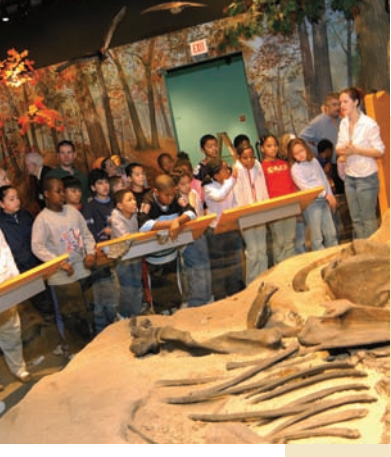
Newark Museum, Newark (Newark Museum)

merchandise), enhanced interpretation at parks and recreation areas, creation of inventories and evaluation of the impact of heritage tourism.