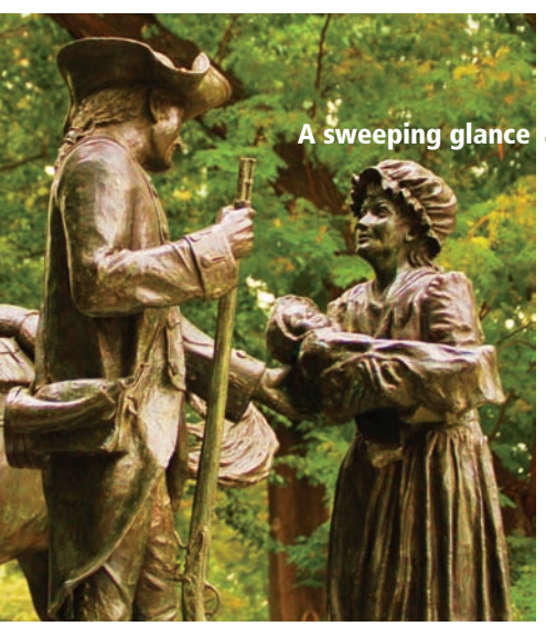
The Green, Morristown (Ari Hahn)

Heritage tourism is... traveling to experience the places and activities that authentically represent the stories and people of the past. It includes historic, cultural and natural resources.