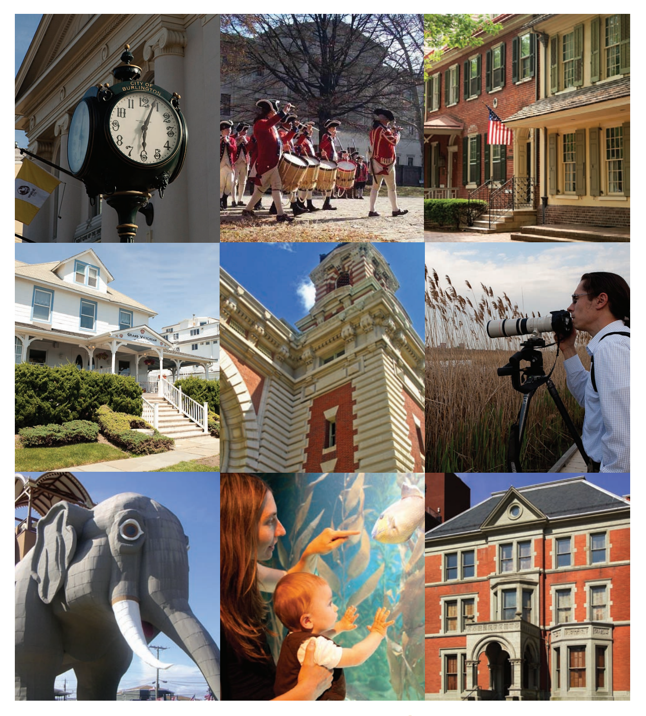
A Heritage Tourism Plan for New Jersey Executive Summary | June 2010