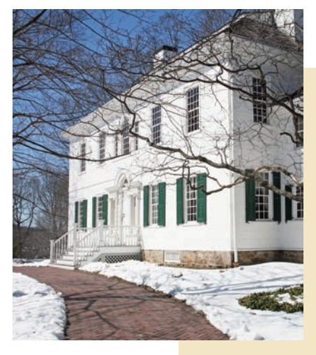
Ford Mansion, Morristown National Historical Park, Morristown