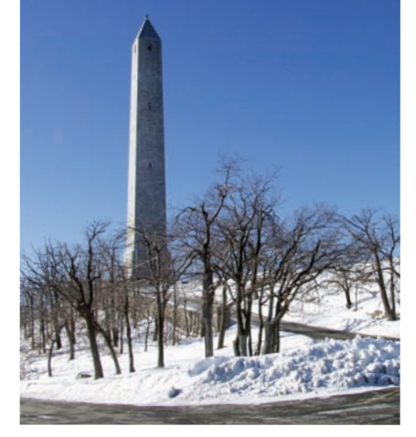
High Point Monument, High Point State Park (New Jersey Office of Information Technology)

"It is critical for New Jersey to develop a uniform system to measure how our tourism industry is performing each year. This tool will allow us to make accurate yearly performance comparisons to adjust our tourism policies according to the data collected." SENATOR JIM WHELAN, District 2