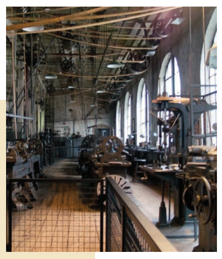
Thomas Edison National Historical Park, West Orange

were opened to the public for the first time in October 2009 after a 6-year, $13 million restoration effort. Between opening day October 9, 2009 and January 3, 2010, close to 16,000 visitors toured the laboratory complex; 6,000 also visited Edison's home, Glenmont.