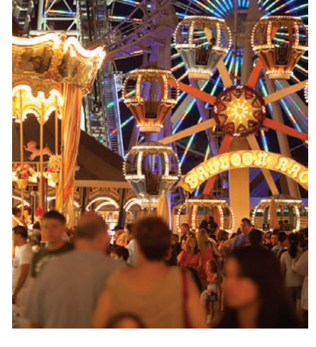
25th Avenue Amusement Pier, Wildwood

New Jersey Historic Preservation Office and New Jersey Department of Community Affairs. Grant and technical assistance requests to these agencies always exceed available resources.